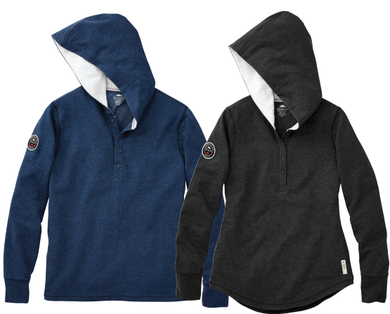
552 Indigo Heather