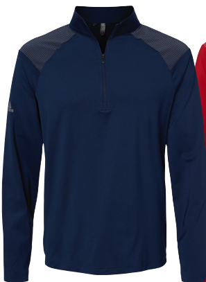
Team Navy Blue