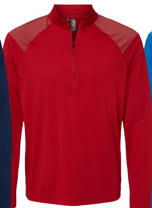
Team Power Red