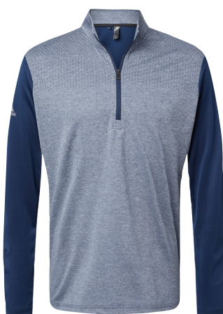
Collegiate Navy Mélange/ Black