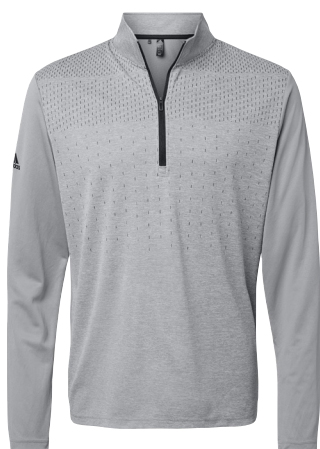
Grey Three Mélange/ Black