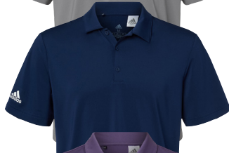
Team Navy Blue